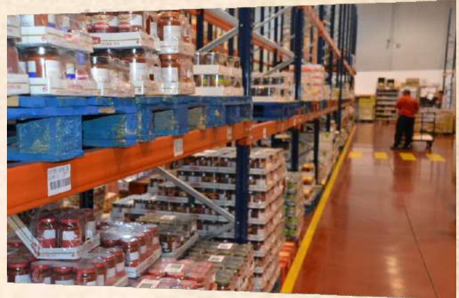
Real pictures of our warehouse